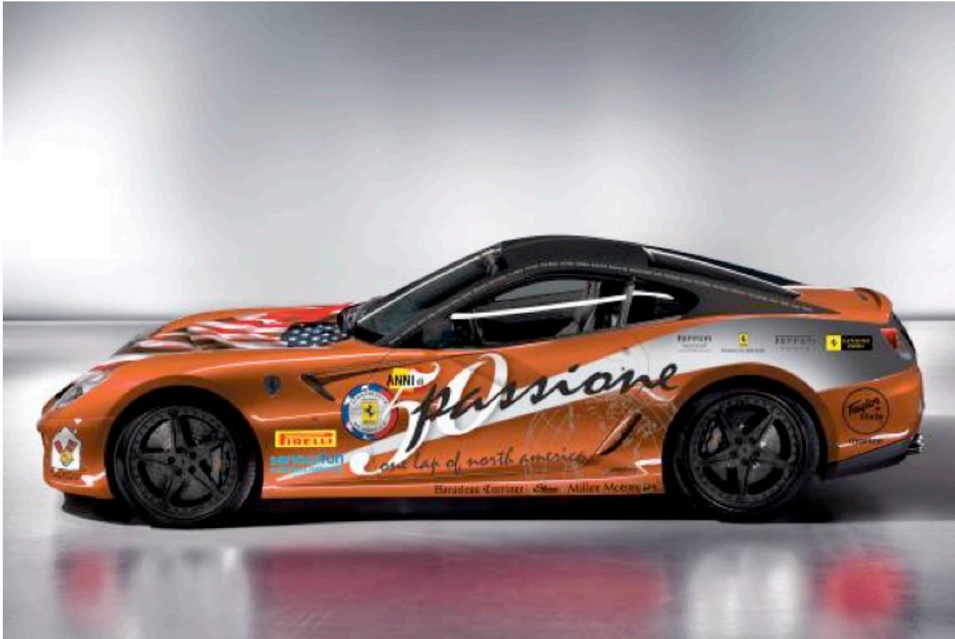
2012 Ferrari 599 HGTE